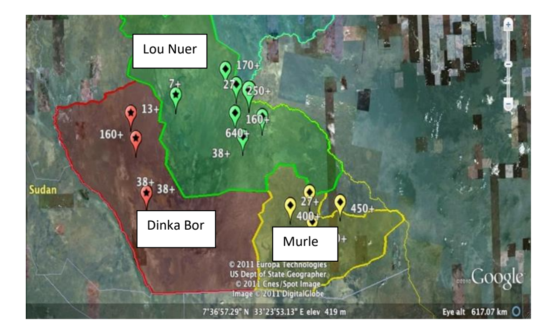
Figure 3. Jonglei conflict map Note . Source, Europa Technologies/US Dept. of State Geographer (2011)