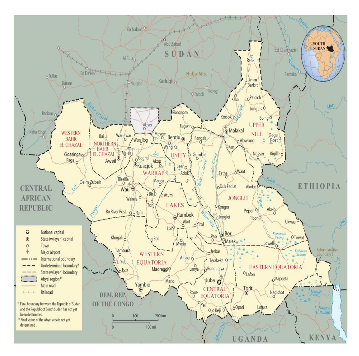
Figure 2. Republic of South Sudan Note.